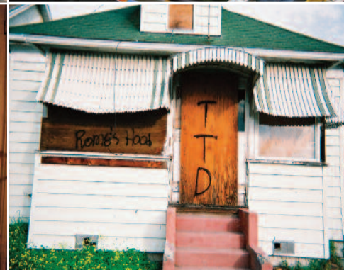
Photos: (Left) Green for all Rally. (Upper center) Chevron refinery in Richmond. (Lower center) Oscar Grant memorial graffiti. (Upper right) Bus Riders Union organizes in Los Angeles. (Lower right) Foreclosed home in Richmond, CA.