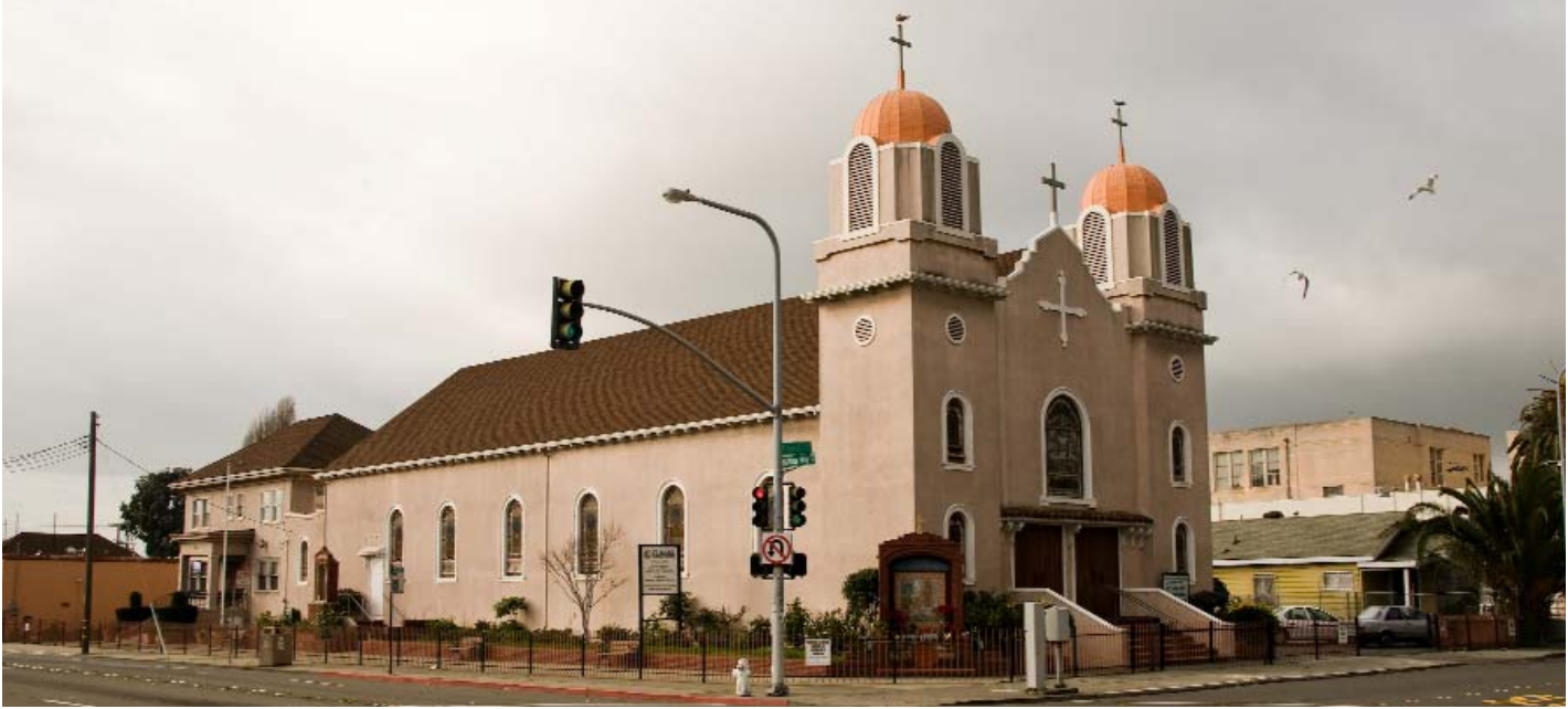
Photo: St. Mark's Church located in the "Iron Triangle" of Richmond is noted for its community organizing and social activism.