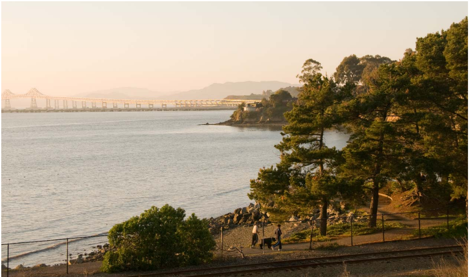
■ Photos: (Above) Refinery and industrial areas in Contra Costa County, west of Richmond. (Below) The view north toward the Richmond Bridge and the oil shipping terminals from the Miller Knox Regional Shoreline Park.